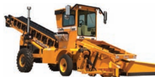
3000 Force Feed Loader