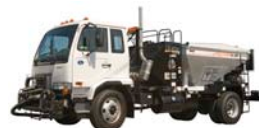
RA-400 Spray Patcher